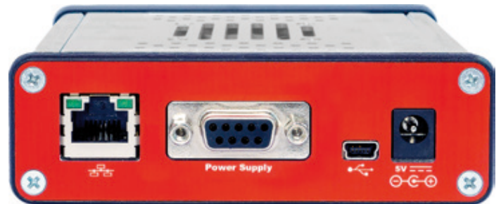
DT5770 rear view

All CAEN Control Software are available for free download on the web site.